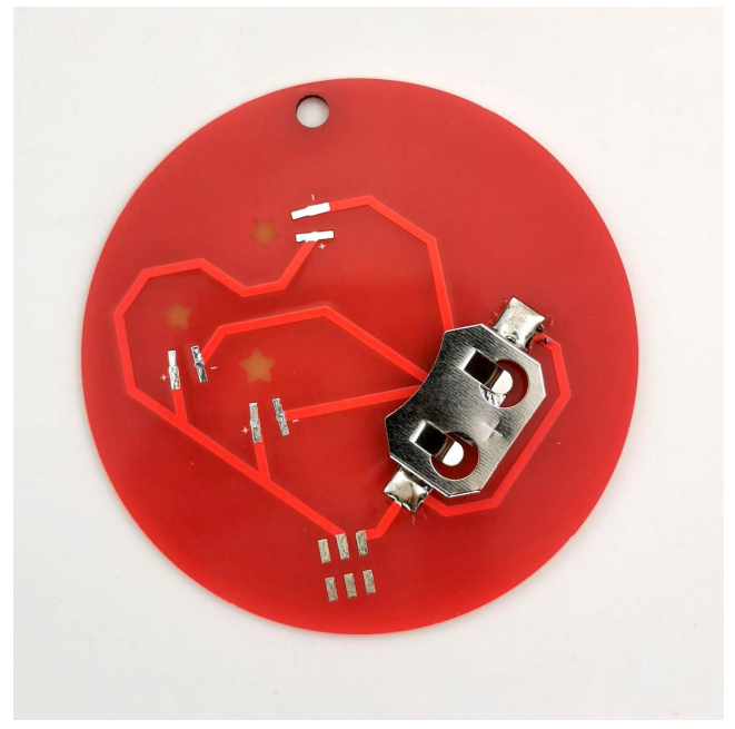
Step 1: Battery holder

First solder one side of the battery holder to one of the two big soldering points on the PCB. The holder itself has no polarity, as long as the "+" mark faces upwards.